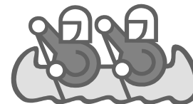
Cub Scouts are introduced to canoe skills on the waters of Lake George.