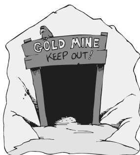
Be prepared to have fun!