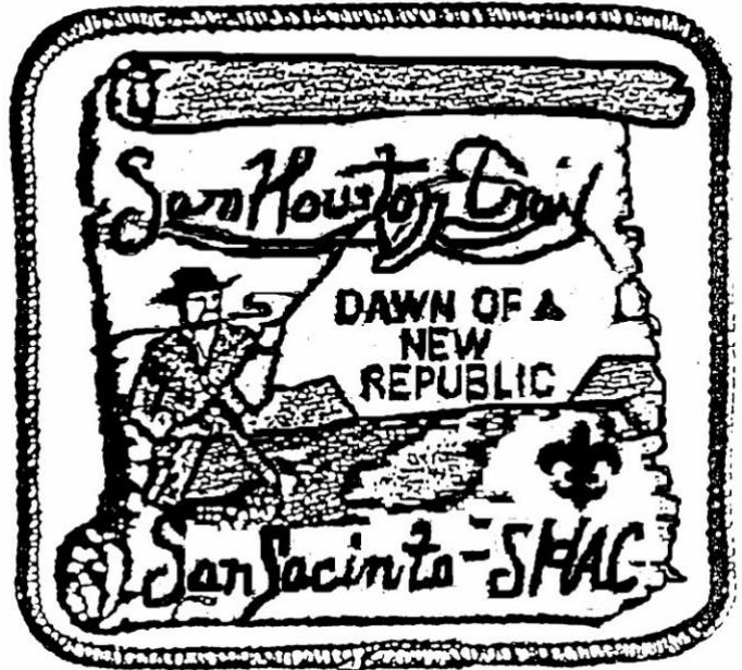
Sam Houston Area Council Boy Scouts of America